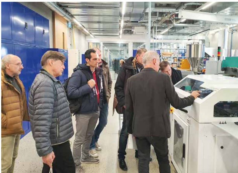
Fig. 2 Participants in front of the binder jetting machine

tives of Cemented-Carbide Production. He started with an overview of different application fields. More than 60 % of the hardmetal parts are used in mechanical engineering and production. Later he showed the effect of the tungsten carbide grain size and the cobalt content on the hardness, flexural strength, fracture toughness and thermal conductivity. Later the effect of different metal binder