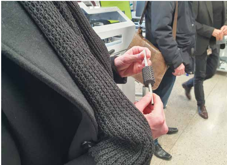
Fig. 1 Demonstration of the graphite based heat and mass heat exchanger